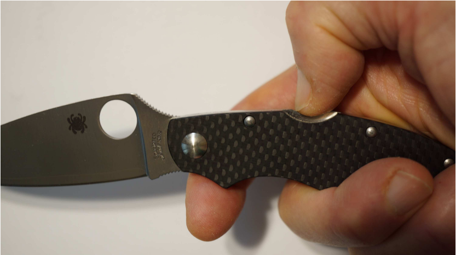
Figure 32: The correct way to close a lockback knife with one hand