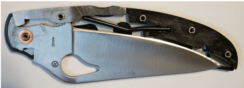
Figure 30: Lockback lock—blade closed

When you press down on the lockback bar , which is a substantial metal bar running along the spine of the handle, the bar rotates around the lockback pivot so that the front of the bar raises up and releases the blade. The lockback bar is held in the