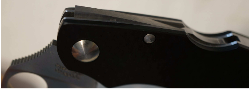
Figure 28: Lockback lock—blade partially open

The lockback lock is shown in Figures 28, 29 and 30.