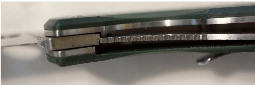
Figure 33: The liner lock