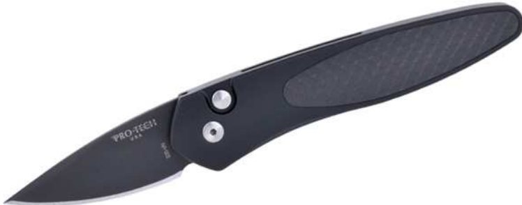
Figure 27: The Half Breed automatic knife (Pro-Tech)

Actually, in some parts of the country, automatic knives are legal if and only if the blade length is under 2 inches. The California-based knife company Pro-Tech produces some automatic knives just for this market. Figure 27 shows the Half Breed from Pro-Tech, a very well made little switch blade for the kid in most of us.