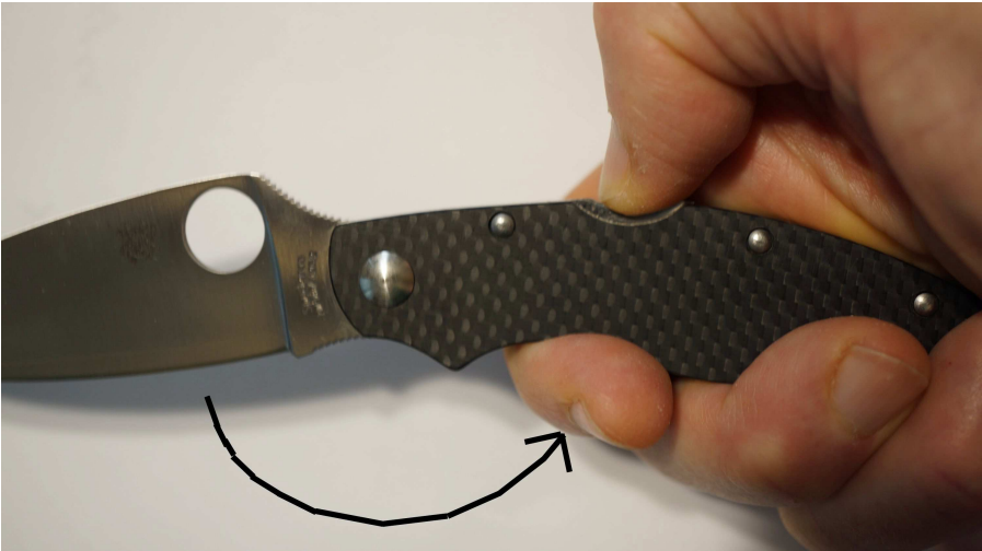
Figure 31: The WRONG way to close a lockback knife with one hand

I should also mention that lockback knives require some special attention when closing, lest you cut yourself. (This really applies to all types of knives, but I think more so to lockback knives.) Specifically, if you hold the knife as in Figure 31 when you disengage the lock, the blade may very well swing down and back up into your finger, causing a nasty cut! (This happened to me twice when I got my first lockback knife many years ago. You would think that I would have learned after the first time!)